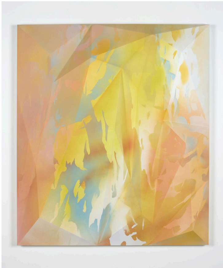
The Soldier and Death, 2024 Acrylic on aluminum composite panel 41 x 47 x 6 in

In part a nostalgic exploration of the formative images and experiences of his youth, this exhibition asks us to consider what it means to search for the unknown, whether in pursuit of a reported Sasquatch or exploring uncharted territories of new artistic mediums. In an era of rapid technological developments and big picture questions about the threat of automation, digital sentience, and originality in the face of artificial intelligence, Nothing to Fear is a reminder to make light in the shadow of anxiety.